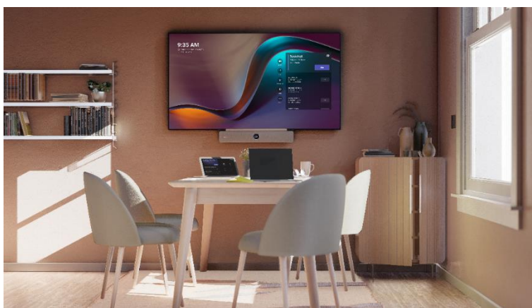
Figure 2 - Cisco Room Bar Running the Microsoft Teams Rooms App

However, even the best video interop experience is not as good or feature-rich as a native calling experience using the host platform’s own app.