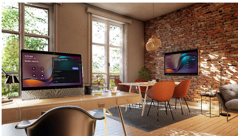
Figure 3 - Cisco Desk Pro (left) and Cisco Board Pro (right) Running Microsoft Teams

In the past, to join a Webex meeting, these systems would have used WebRTC. But with app switching, these systems will temporarily switch into Webex mode and provide a native, full-featured Webex experience. When the call ends, the systems will revert to Microsoft Teams Rooms mode.